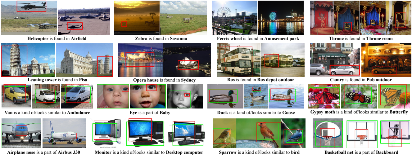
Figure 5. Qualitative Examples of Scene-Object (rows 1-2) and Object-Object (rows 3-4) Relationships Extracted by NEIL

each and every labeled instance and each and every relationship for correctness. Therefore, we randomly sample the 500 visual instances and 500 relationships, and verify them using human experts. At the end of iteration 6, 79% of the relationships extracted by NEIL are correct, and 98% of the visual data labeled by NEIL has been labeled correctly. We also evaluate the per iteration correctness of relationships: At iteration 1, more than 96% relationships are correct and by iteration 3, the system stabilizes and 80% of extracted relationships are correct. While currently the system does not demonstrate any major semantic drift, we do plan to continue evaluation and extensive analysis of knowledge base as NEIL grows older. We also evaluate the quality of bounding-boxes generated by NEIL. For this we sample 100 images randomly and label the ground-truth bounding boxes. On the standard intersection-over-union metric, NEIL generates bounding boxes with 0.78 overlap on average with ground-truth. To give context to the difficulty of the task, the standard Objectness algorithm [1] produces bounding boxes with 0.59 overlap on average.