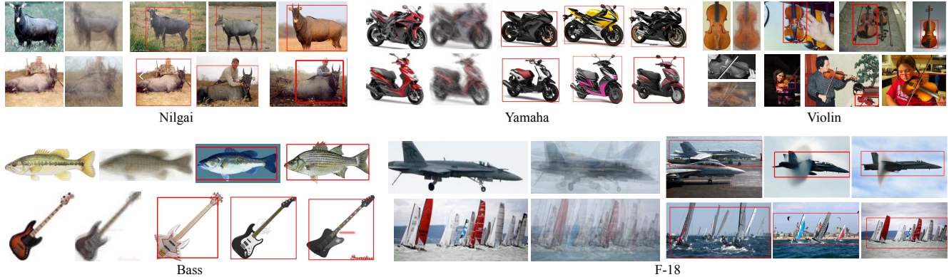
Figure 4. Qualitative Examples of Bounding Box Labeling Done by NEIL

is part of the catalogue. For example, if “Wheel is a part of Car” exists in the catalogue then this term will be the product of the score of wheel detector and the compatibility function between the wheel window ( x_l ) and the car window ( x ). The final term measures the scene-object compatibility. Therefore, if the knowledge base contains the relationship “Car is found in Raceway”, this term boosts the “Car” detection scores in the “Raceway” scenes.