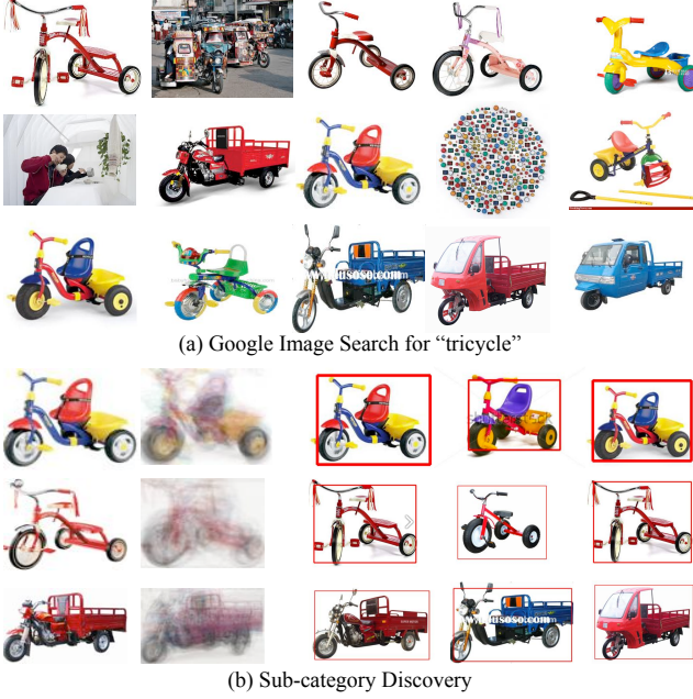
Figure 3. An example of how clustering handles polysemy, intra-class variation and outlier removal (a). The bottom row shows our discovered clusters.

ments represent the probability of simultaneous detection of object categories i and j . Intuitively, the co-detection matrix has high values when object detector i detects objects inside the bounding box of object j with high detection scores. To account for detectors that fire everywhere and images which have lots of detections, we normalize the matrix O_0 . The normalized co-detection matrix can be written as: N_1^{-\frac{1}{2}} O_0 N_2^{-\frac{1}{2}} , where N_1 and N_2 are out-degree and in-degree matrix and (i, j) element of O_0 represents the average score of top-detections of detector i on images of object category j . Once we have selected a relationship between pair of categories, we learn its characteristics in terms of mean and variance of relative locations, relative aspect ratio, relative scores and relative size of the detections. For example, the nose-face relationship is characterized by low relative window size (nose is less than 20% of face area) and the relative location that nose occurs in center of the face. This is used to define a compatibility function \psi_{i,j}(\cdot) which evaluates if the detections from category i and j are compatible or not. We also classify the relationships into the two semantic categories (part-of, taxonomy/similar) using relative features to have a human-communicable view of visual knowledge base.